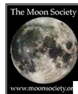
The Moon Society